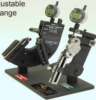
Series BX/CX-ER External Adjustable Extended Range